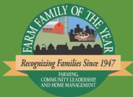
Conway County - Clay & Alisha Stover (Plumerville)